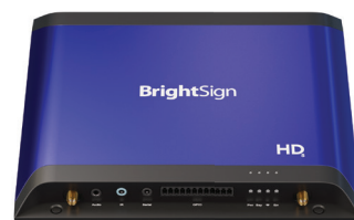
Expanded I/O Package