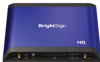
Standard I/O Package